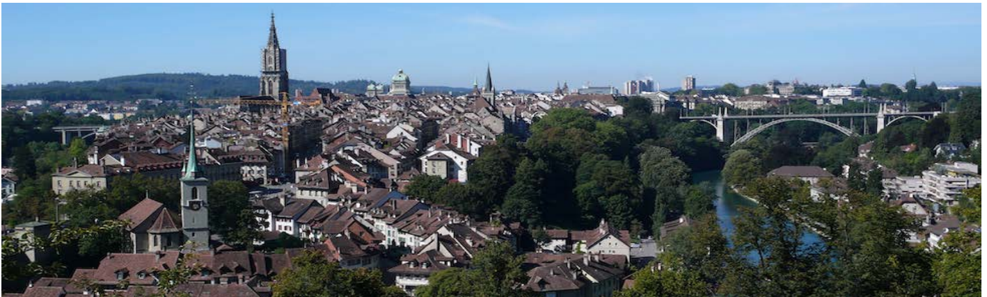
Bern, Switzerland

September 13 to 15, 2023 in Bern, Switzerland