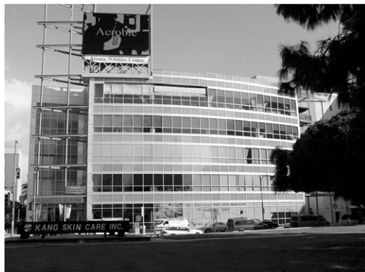
Figure 2. The Eastward Facade of Aroma Wilshire Center, 2004

Simultaneously, such a response implies that there is a significant social stratification among what is stereotypically called ‘Korean American entrepreneurs’ or ‘Korean American community’ in Koreatown.