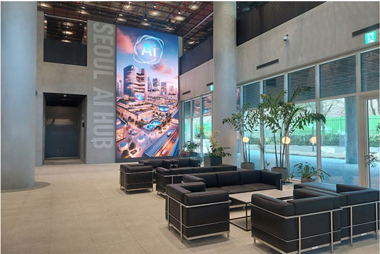
Seoul AI Hub (source: https://www.seoulaihub.kr/eng1/company1/company05.asp )

Site visits will include: SNU AI Research, Seoul AI Hub, and Digital Media City (Sangam DMC).