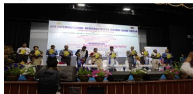
Abstract Volume release