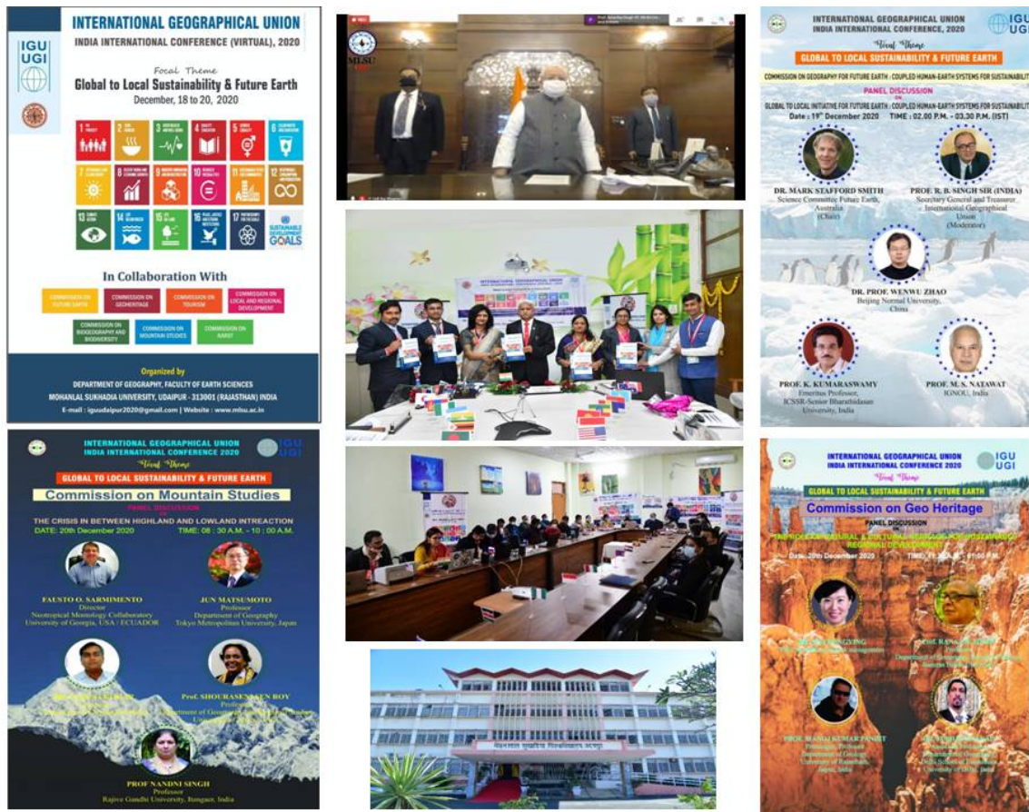
Glimpses of The IGU, India International Conference 2020 on “Global to Local Sustainability & Future Earth

The IGU-India International Conference 2020 on “Global to Local Sustainability & Future Earth” being organized by the Department of Geography, Mohanlal Sukhadia University, Udaipur, Rajasthan, INDIA on 18-20 December, 2020. The conference was joined by more than 800 of participants from about 40 countries including Afghanistan, Kazakhstan, Algeria, Kenya, Argentina, Kyrgyzstan, Australia, Libya, Bangladesh, Lithuania, Benin, Macedonia, Canada, Mongolia, Myanmar, Nigeria, China, Philippines, Egypt, Poland, Ethiopia, Qatar, Haiti, Romania, Hungary, Russia, India, South Africa, Indonesia, Thailand, Iran, United States, Italy, Vietnam, Japan, Zambia, Zimbabwe, etc. Three days’ conference is held in Mohanlal Sukhadia University, in the meeting hall and other buildings. More than 800 attendees, paper presenters, keynote and numerous panel discussion, academic and social community have benefited in many ways from this conference. More than 200 scientific papers were presented by authors from all participated countries. This Conference is organized in collaboration with several IGU Commissions such as Commission on Future Earth, Commission on Geo-Heritage, Commission on Tourism, Commission on Local and Regional Development, Commission on Bio Geography and Biodiversity, Commission on Mountain Studies, Commission on Karst.