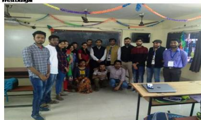
Participants of Training Programme