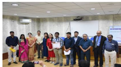
Best Paper Awardee